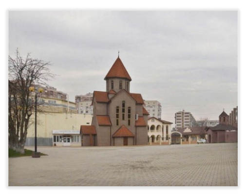
Krasnodar Russia XXIe Century

Guilbert's construction for the apostolic community of Armenians in Paris is not the only one that used the Cathedral of Etchmiadzin as a model. If you flip through Claudio Gobbi's catalog, we are transported to Bucharest, Cairo, or Marseille, where we see Armenian churches for which the archetype must have been found in Etchmiadzin. All of these examples are far outside of the historical territories of Armenians and the present-day republic. Around the globe, these buildings are a clear indication of the Armenian diaspora.