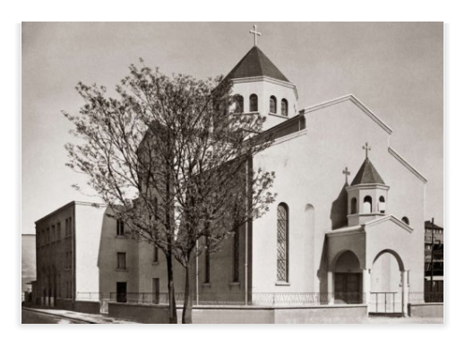
Lyon France XXe Century

Both the Church of St. Hripsime and the Cathedral of Etchmiadzin are recognized as the oldest surviving religious buildings in Armenia. As incunabula, they may have functioned as models for the churches today, which originated in areas populated by Armenians over the centuries. "Like all of the churches of Armenia," Tavernier declared in 1655 speaking of the type of cruciform church which he had also seen during his journey to St. Stephanos Church near Nakhichivan in today's Iran and in the dramatically positioned monastery of Khor Virap. Today, this monastery is the most photographed subject in the country [9]. Likewise, Claudio Gobbi could not escape a certain fascination with the scenery of the great Ararat and also recorded an image of the monastery for this publication.