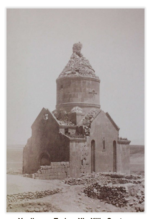
Yagikesen Turkey XIe-XIIIe Century

Both the Church of St. Hripsime and the Cathedral of Etchmiadzin are recognized as the oldest surviving religious buildings in Armenia. As incunabula, they may have functioned as models for the churches today, which originated in areas populated by Armenians over the centuries. "Like all of the churches of Armenia," Tavernier declared in 1655 speaking of the type of cruciform church which he had also seen during his journey to St. Stephanos Church near Nakhichivan in today's Iran and in the dramatically positioned monastery of Khor Virap. Today, this monastery is the most photographed subject in the country [9]. Likewise, Claudio Gobbi could not escape a certain fascination with the scenery of the great Ararat and also recorded an image of the monastery for this publication.