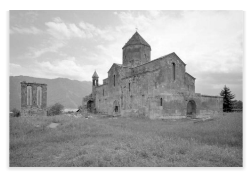
Odzun Armenia VIe Century

Ani is a myth. Abandoned since the 14th century, today it is a city of ruins in eastern Turkey. Concentrated in the former metropolis of 100,000, are the remnants of a highly developed Armenian religious architecture from the 10th and 11th centuries. In early travelogues visitors brought stories to Europe of the "City of 1001 Churches," as Heinrich von Poser first described it in 1675 [19]. While initially only merchants, as was the aforementioned Tavernier, and diplomats visited the Caucasus, expeditions to the Armenian region by researchers and inquisitive Westerns became more frequent in the 19th century [20].