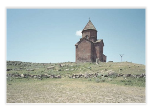
Imbatavank Armenia VIIe Century

is entirely made up of quadrants / and although the building is not too far / a large sum of gold and silver has been spent there [5].