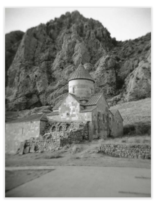
Noravank Armenia XIVe Century

architecture from Persian and Byzantine sources at the turn of the 6th and 7th centuries. This was the heyday of Armenian culture, a time of relative peace with Byzantium, the Arabs, and Iran. Domed churches are strewn across the whole of Armenian settlement areas from the 7th century. Including the third most important church of the Etchmiadzin patriarch, St. Gayane (630-643 AD), or the impressive Cathedral of Zvartnots, constructed between 630 and 660 AD with a rotunda spanning 37 meters [14]. Today it is in ruins.