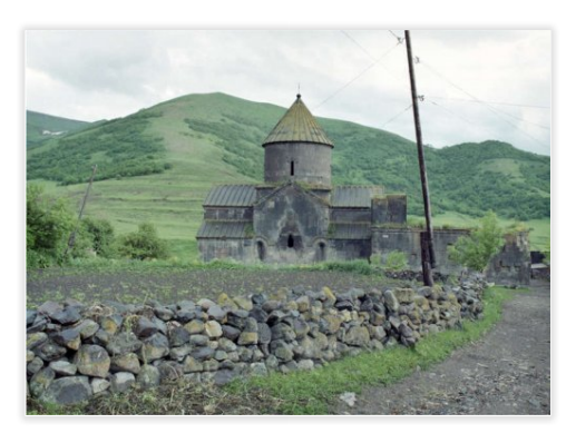
Yeghipatrush Armenia Xe-XIIIe Century

Ani is a myth. Abandoned since the 14th century, today it is a city of ruins in eastern Turkey. Concentrated in the former metropolis of 100,000, are the remnants of a highly developed Armenian religious architecture from the 10th and 11th centuries. In early travelogues visitors brought stories to Europe of the "City of 1001 Churches," as Heinrich von Poser first described it in 1675 [19]. While initially only merchants, as was the aforementioned Tavernier, and diplomats visited the Caucasus, expeditions to the Armenian region by researchers and inquisitive Westerns became more frequent in the 19th century [20].